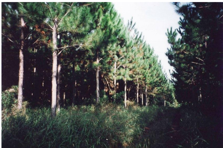
Provincia de Misiones / Pin plantation 10 years' growth