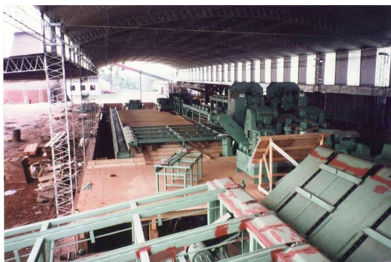
Major sawmill plant